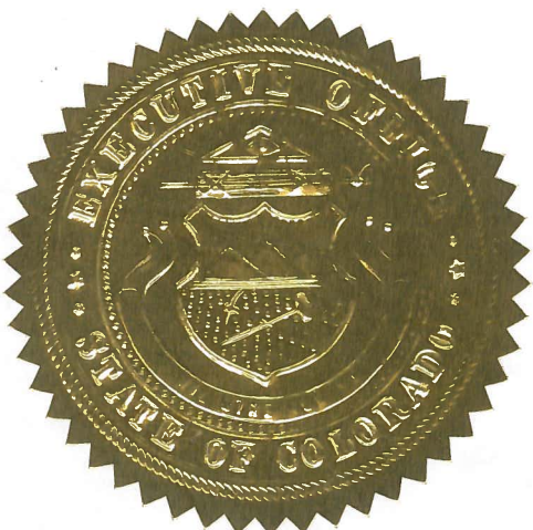
Jared Polis Governor

GIVEN under my hand and the Executive Seal of the State of Colorado, this first day of April, 2019